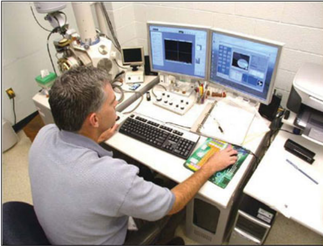
Hamilton County Coroner's Office SEM/EDS system